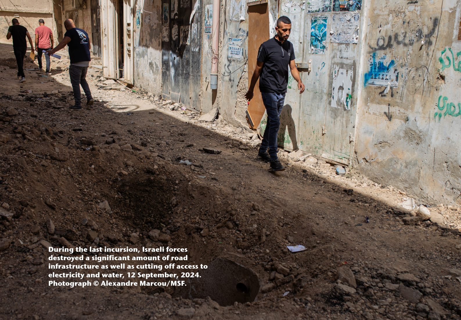
During the last incursion, Israeli forces destroyed a significant amount of road infrastructure as well as cutting off access to electricity and water, 12 September, 2024.