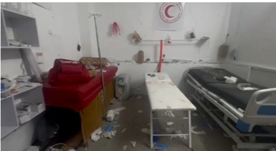
Damage done to the stabilisation point in Nur Shams camp, Tulkarem, following an Israeli incursion on 16-17 December 2023.