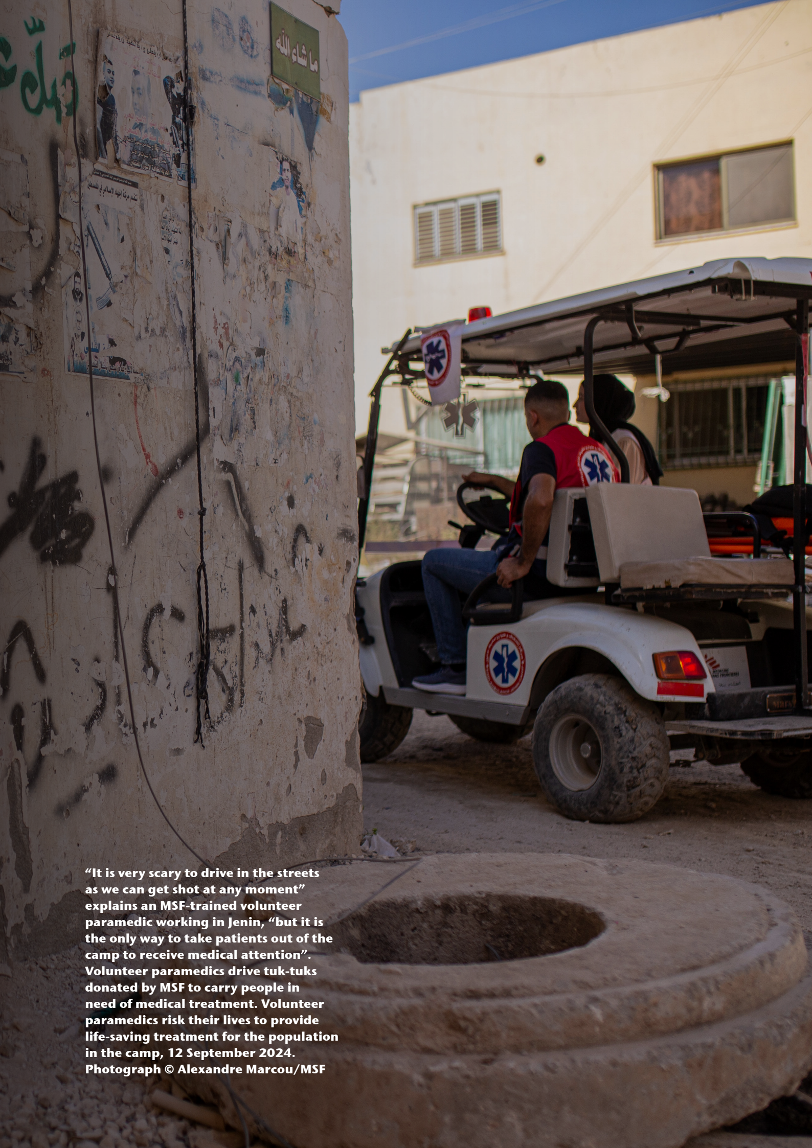
“It is very scary to drive in the streets as we can get shot at any moment” explains an MSF-trained volunteer paramedic working in Jenin, “but it is the only way to take patients out of the camp to receive medical attention”. Volunteer paramedics drive tuk-tuks donated by MSF to carry people in need of medical treatment. Volunteer paramedics risk their lives to provide life-saving treatment for the population in the camp, 12 September 2024.