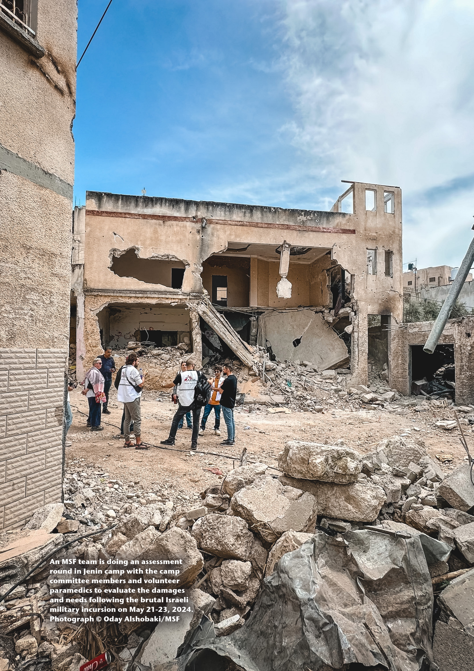
An MSF team is doing an assessment round in Jenin camp with the camp committee members and volunteer paramedics to evaluate the damages and needs following the brutal Israeli military incursion on May 21-23, 2024.